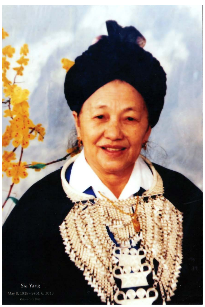
May 8, 1918 – September 6, 2013

PRESENTED BY THE HMONG AMERICAN EDUCATION FUND